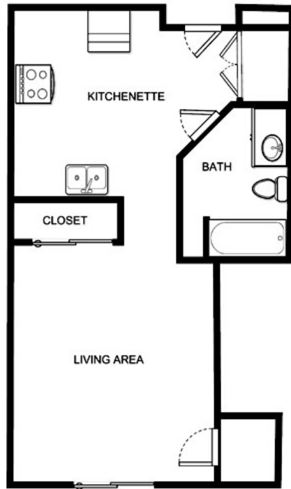
STUDIO - A03

Apartment Number _____ Square Footage _____