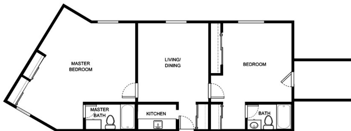
TWO BEDROOM 6

Apartment Number _____ Square Footage _____