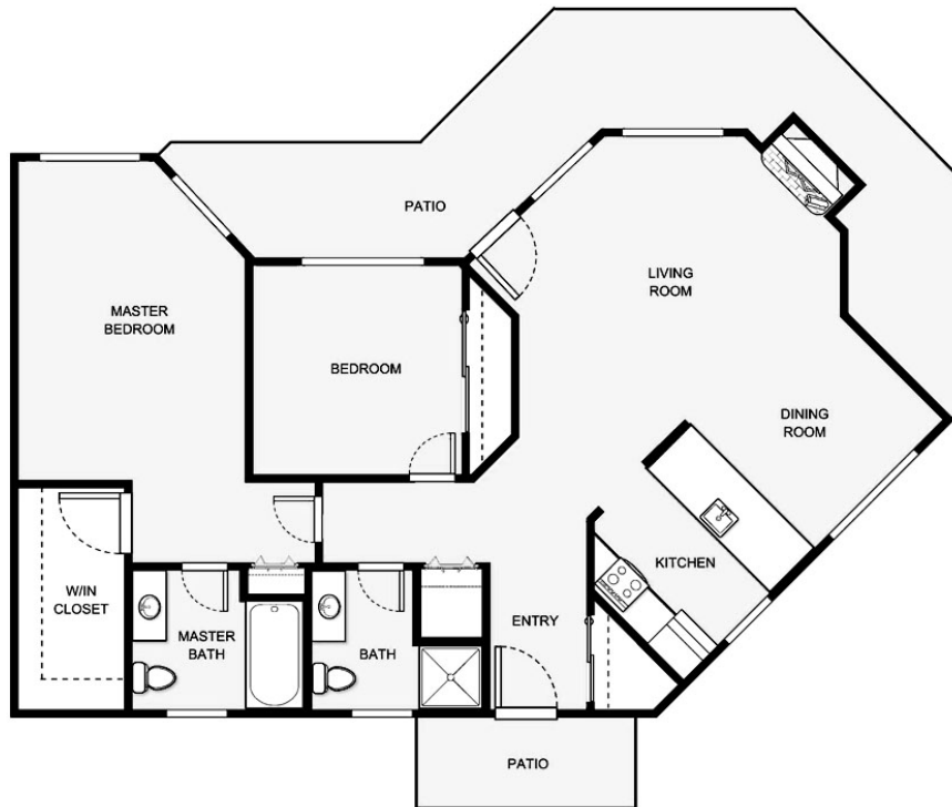
GARDEN SUITE C-1

Apartment Number _____ Square Footage _____